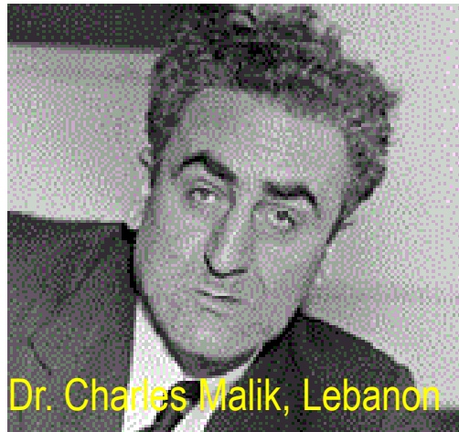
Dr. Charles Malik, Lebanon