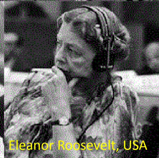
Eleanor Roosevelt, USA