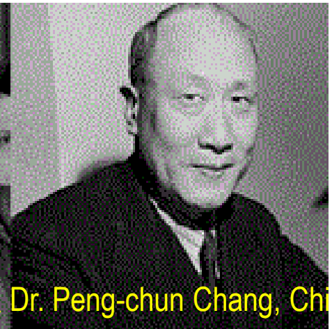
Dr. Peng-chun Chang, China